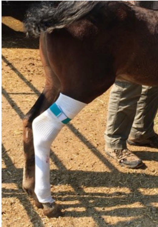
Sport Pony size tubes used to bandage.

Contact us regarding any of these solutions. We try hard to help every horse and hold down costs whenever we can. Wounds and their locations on the body can influence the best solution in bandaging. Send photos of close up views, in focus, good lighting, as well as a view that orients us to the location on the body. Seeing the wound or dermatitis will help us recommend the best bandaging solution.