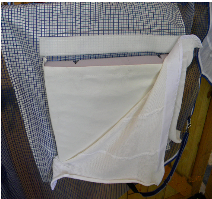
Interior shot showing the pocket, foam insert, loop Velcro and silver sock panel attached to a flysheet.

Once we receive the marked-up flysheet from our client, we use an upholstery company that specialized in cars/boats/trucks. They are the only ones with the heavy-duty upholstery foam, hook & loop, and sewing machines capable of the construction we require. This is not a homemade project!