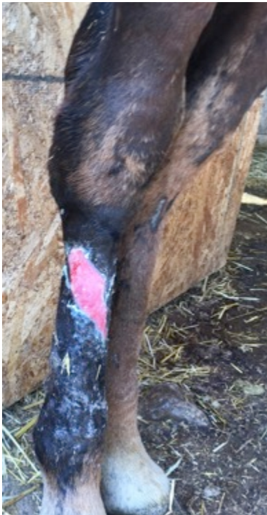
Leg injury on a colt

Showing the tubes double layered for more compression in the first view and single layered over both hocks in the second view.